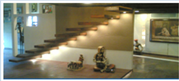
Satguru Art gallery, Bandra