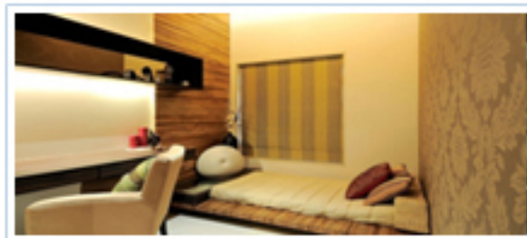
Show Flat for Kalpataru